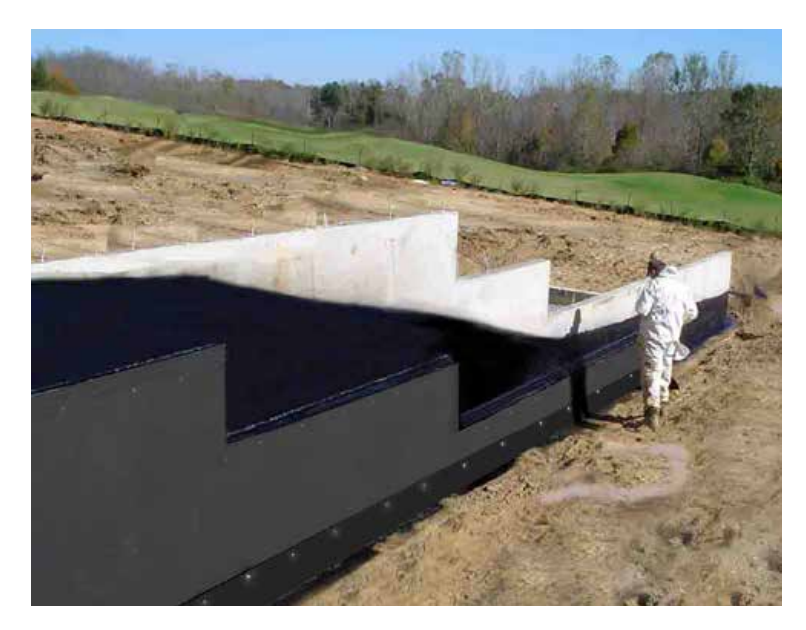
BD2500 is amply tough and economically sensible for all conditions.

The information and recommendations discussed in this publication are believed to be correct. The ASTM testing is conducted by an independent accredited laboratory. No statement should be construed as a recommendation for any use, which would violate any patent rights. This document is not a guarantee of a warranty, if approved by GMX, Inc., a performance warranty may be granted.